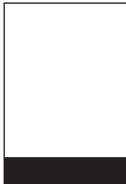
Page Strip 10x2" $160