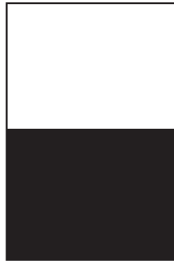
Half Page 10x6" $300