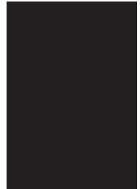
Back Page 11x17" $675