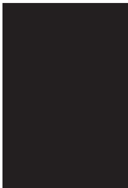
Full Page or Insert 11x17" $500