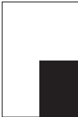
1/4 Page 5x6" $155