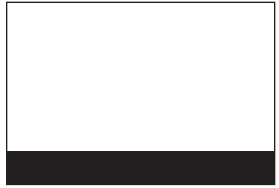
Two Page Spread Strip 20x2" $375